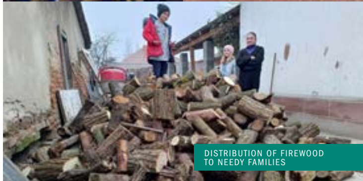
DISTRIBUTION OF FIREWOOD TO NEEDY FAMILIES