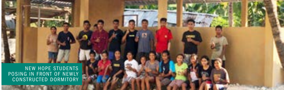
NEW HOPE STUDENTS POSING IN FRONT OF NEWLY CONSTRUCTED DORMITORY

If you would like to support the work of New Hope, please visit the Donate Now tab on our website, and choose "Donate Online" or "Pre-authorized Payment (PAP) Form" to set up scheduled monthly donations. Please choose "New Hope - Timor" as the designated fund.