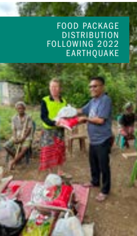
FOOD PACKAGE DISTRIBUTION FOLLOWING 2022 EARTHQUAKE