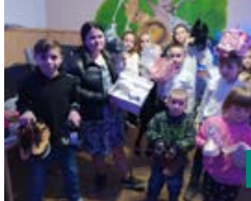
CHILDREN RECEIVING CHRISTMAS GIFTS IN HUNGARY & UKRAINE